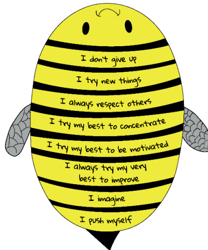
Abbey village 8 Key values

Primary. We believe that by focusing on the eight key values our children will be ready to successfully meet the challenges of the next stage of their education and their lives.